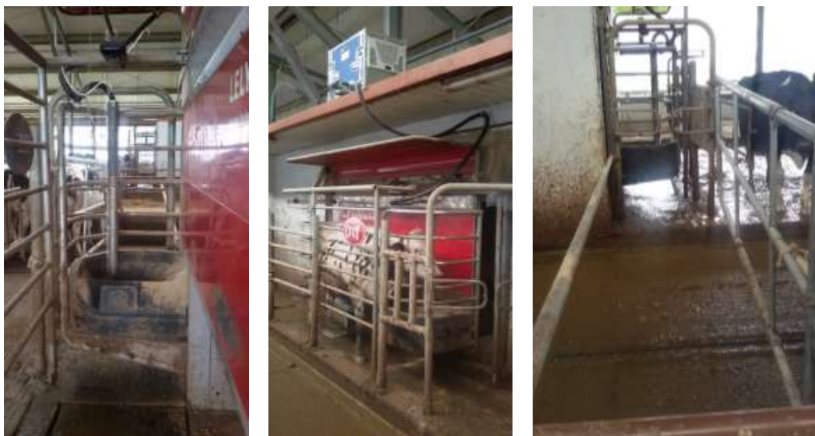
Fig. 1: FTIR methane measurement in the automatic milking system (AMS) (left and centre), pen to hold a cow during the LMD measurement after leaving the AMS (right)

FTIR measurements were carried out during milking in the AMS. Air exhaled by the cow while she was eating the concentrate dispensed in the feed bin was sampled (figure 1). The analyser unit located on top of the milking shed (figure 1) was continuously recording the methane profiles of the exhaled air during the entire milking procedure and stored them in the database as the average concentration from 5 seconds periods.