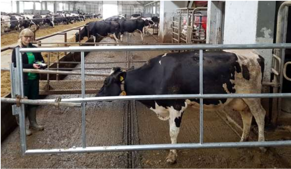
Fig. 2: Measurement of a cow with the Laser Methane Detector after leaving the automatic milking system

A gate and a bar was installed behind the exit of the AMS, such that a small pen was constructed. Cows leaving the AMS were restrained there for the LMD measurement (figure 1). With this setup, the LMD profiles could be taken immediately after the FTIR measurement. The LMD measurements were taken at 1 m distance from the cow's mouth, so that the values recorded in ppm-m by the LMD could be transformed to ppm by dividing by 1 m (figure 2). The LMD (figure 3) is a portable, hand-held device which specifically measures the column density of methane in air without contact to the source by infrared spectroscopy. The wavelength of the laser is specifically set to the absorption of methane. The data are sent via Bluetooth connection to a smartphone running the GasViewer app. The app stores the data in a .csv file on the phone from where they can be transferred to a computer.