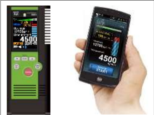
Fig. 3: Laser Methane Detector with GasViewer App on a smartphone (Crowcon Detection Instruments Ltd., Abingdon, UK)